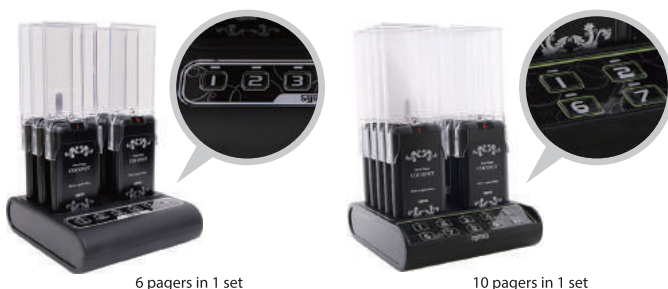
6 pagers in 1 set